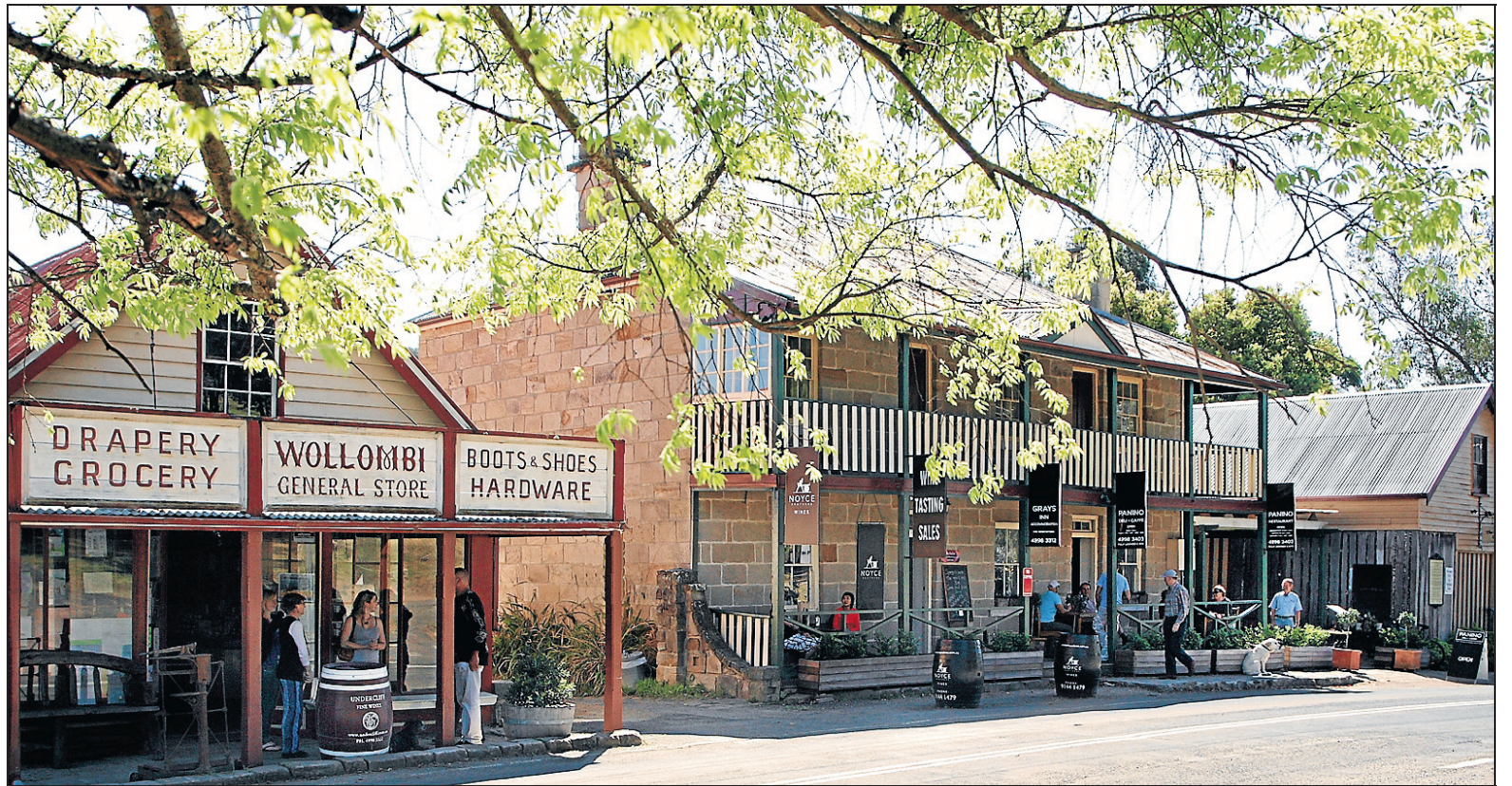
HISTORIC: Wollombi's allure springs from its sandstone and timber-slab buildings which lend it the air of a pioneer town.

from its 19th-century sandstone buildings and timber slab-constructed cottages and sheds.